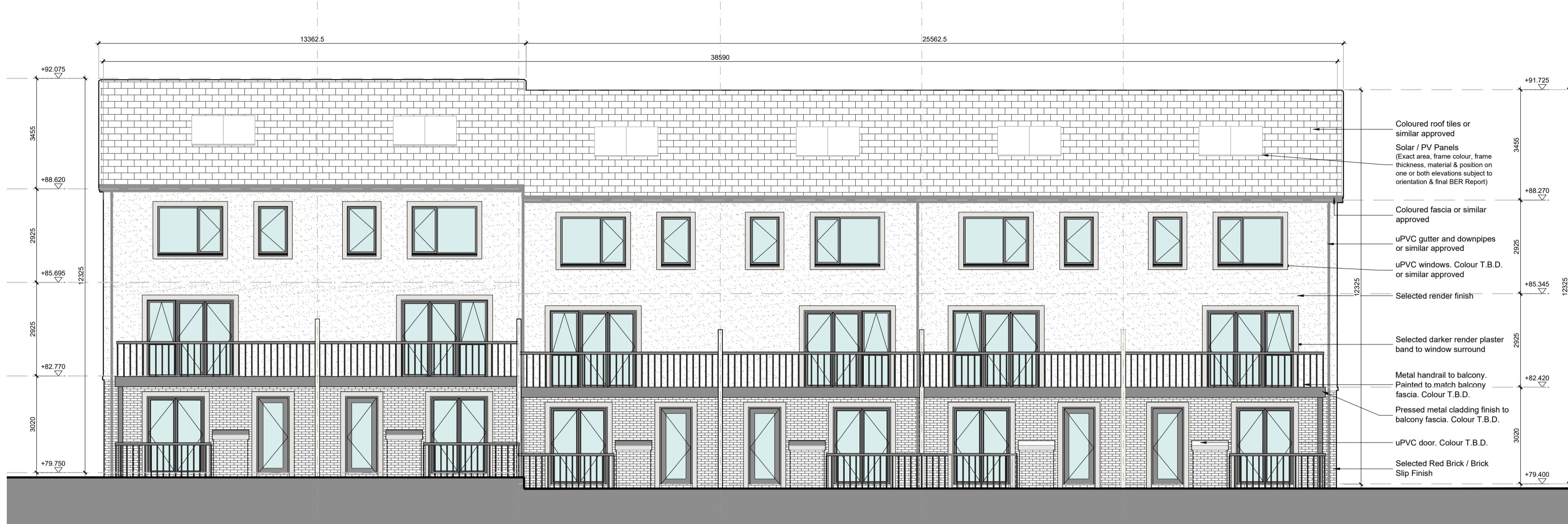
02 South Elevation 1:100 @ A1