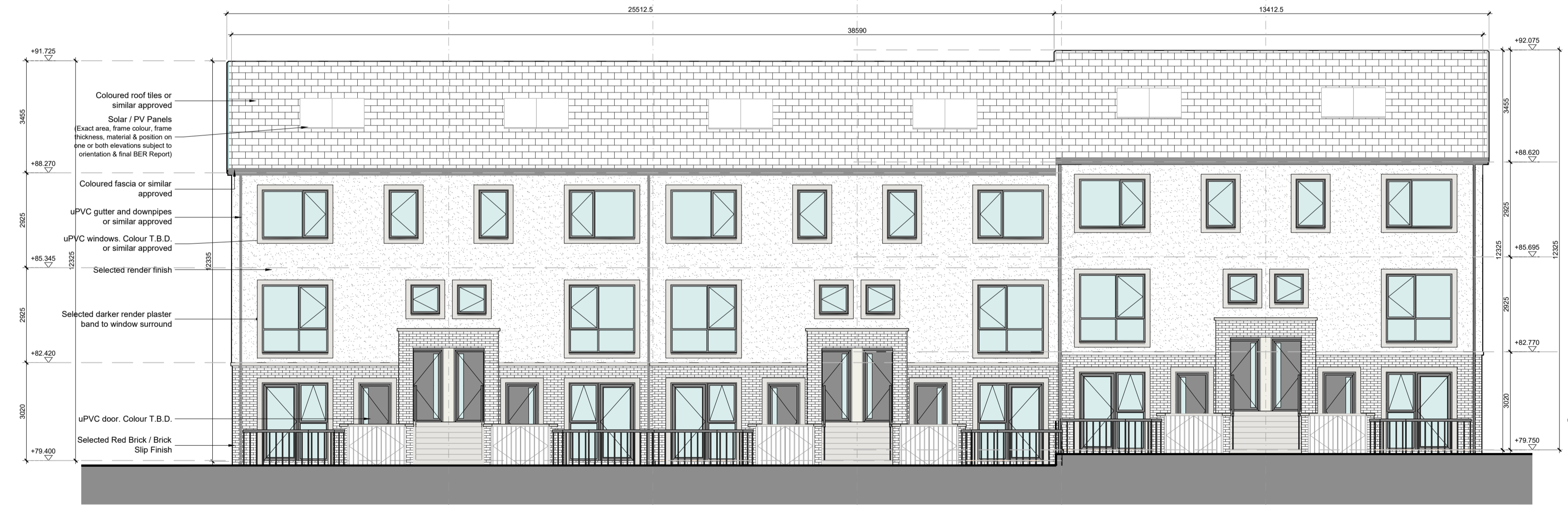
01 North Elevation 1:100 @ A1